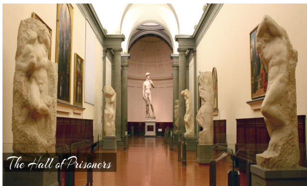
The Hall of Prisoners

The Accademia Gallery occupies some rooms from the XIV century, which belonged to the old hospital of San Mateo as well as to the old monastery of San Nicolás de Cafaggio. This is a must stop for anyone visiting Florence since it houses the "David" of Michelangelo sculpted between 1501-1504 to be an outside decoration of the Cathedral of Florence, it became instead a symbol of the Florentine State commitment to freedom and independence, as well as a symbol of the Medici's defeat in 1494. It still personifies energy, vigor and courage, symbolizing the whole mankind fight for survival. His anatomy, later reproduced by Michelangelo's contemporaries, was carefully depicted, thanks to the in-depth studies carried out by the great artist.